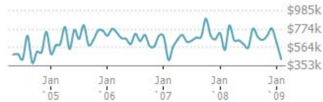
Median Sales Price and Sales Volume (Units)